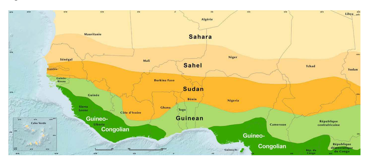
Figure 1: Bioclimatic zones of West Africa

West Africa's pronounced aridity gradient and single season of rainfall (June-September) shape the geographical and temporal distribution of grazing resources and explain the historical north-south transhumance that characterises this region (Nori, 2019). Figure 1 shows the region's five bioclimatic zones, whose average annual rainfall ranges from less than 150mm per year in the Saharan belt to 2,200-5,000mm per year in the very far south (CILSS, 2016).