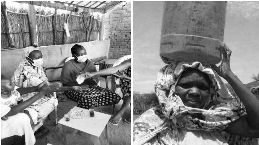
Figure 2. Women of South Kordofan

Left: FGD, Kauda, April 2021.